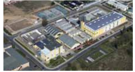
Polyester recycling plant in Germany