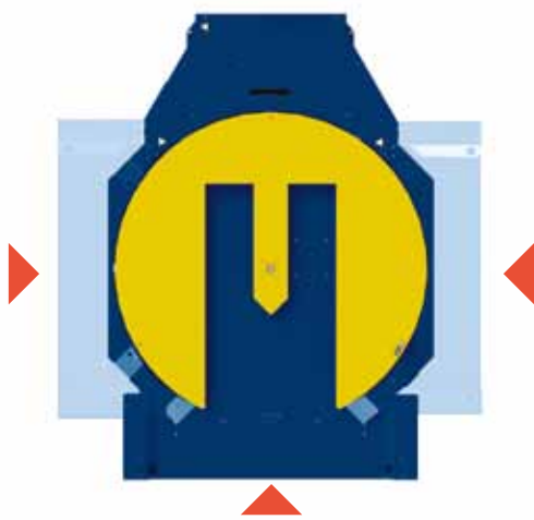
Horseshoe turntable with 3 in feed