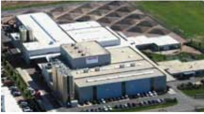
Productions centre for STARstrap™ strapping in Germany