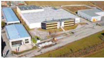
Production centre for machines and equipment in Italy