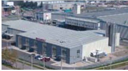
Productions centre for STARstrap™ strapping in Chile