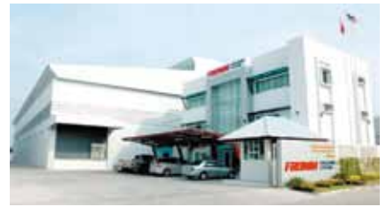
Production centre for STARstrap™ strapping in Thailand