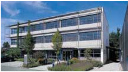
Development centre in Germany