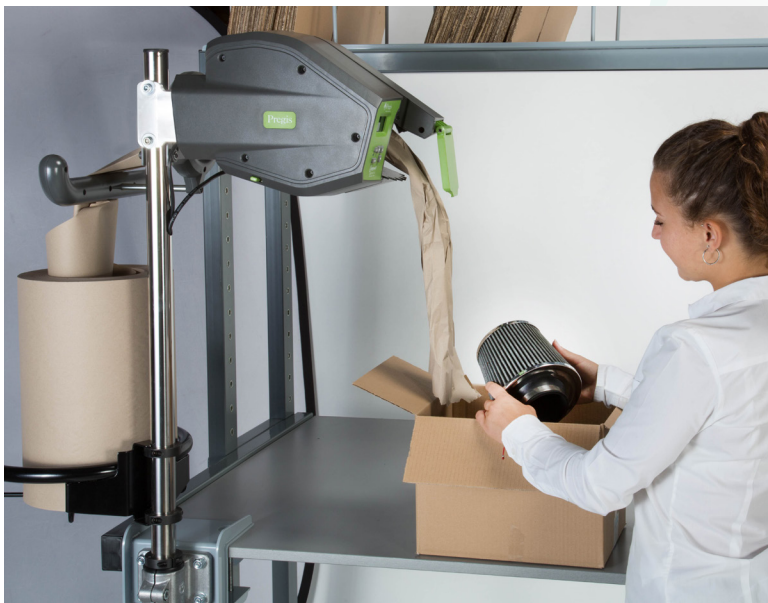
Affix to workstation for total convenience and comfort.