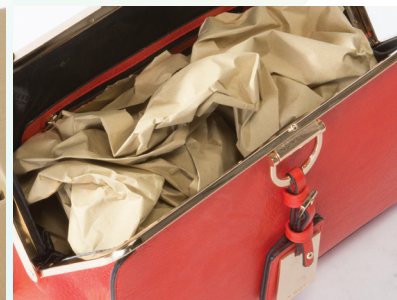
Sustainable paper void-fill is clean, flexible and lightweight.

Quantum™XT delivers 100% recycled paper at speeds of up to 1.8m per second, with the ability to have complete control of output as required to suit all kinds of packing operations.